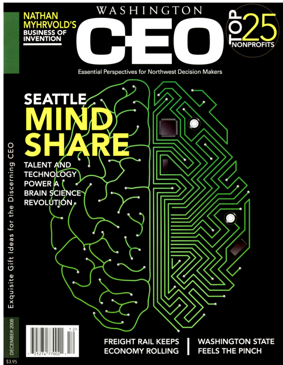
Washington CEO, December 2008, Page 61